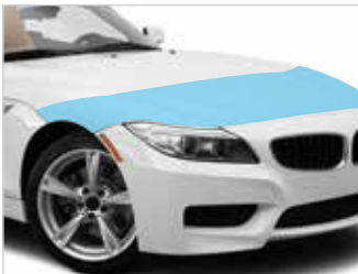
Partial Hood and Fender

Clear gloss polyurethane for stone chip protection, high wear, and abrasion in the automotive, motorcycle, RV, powersports, bicycle, aircraft, and other transportation markets.