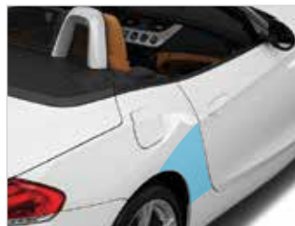
Rear Quarter Panels